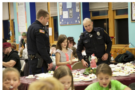
Corning police officers share good times with the children at the Youth Center Holiday Party.

The Laura Richardson Houghton Corning Youth Center is a free after-school drop-in facility for children and teens ages 8 to 18. The Youth Center offers a safe, nurturing atmosphere with activities such as recreational games, field trips, arts & crafts, tutoring, community service, board games, pool, ping pong and educational forums. The Kid's Café provides hungry children with over 19,000 free snacks and nutritious meals each year.