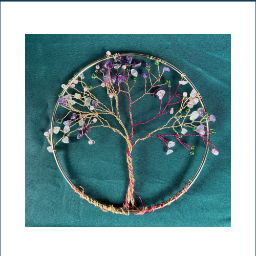
Family Tree created by a family during a home visitation with the support of the Parent Educator.